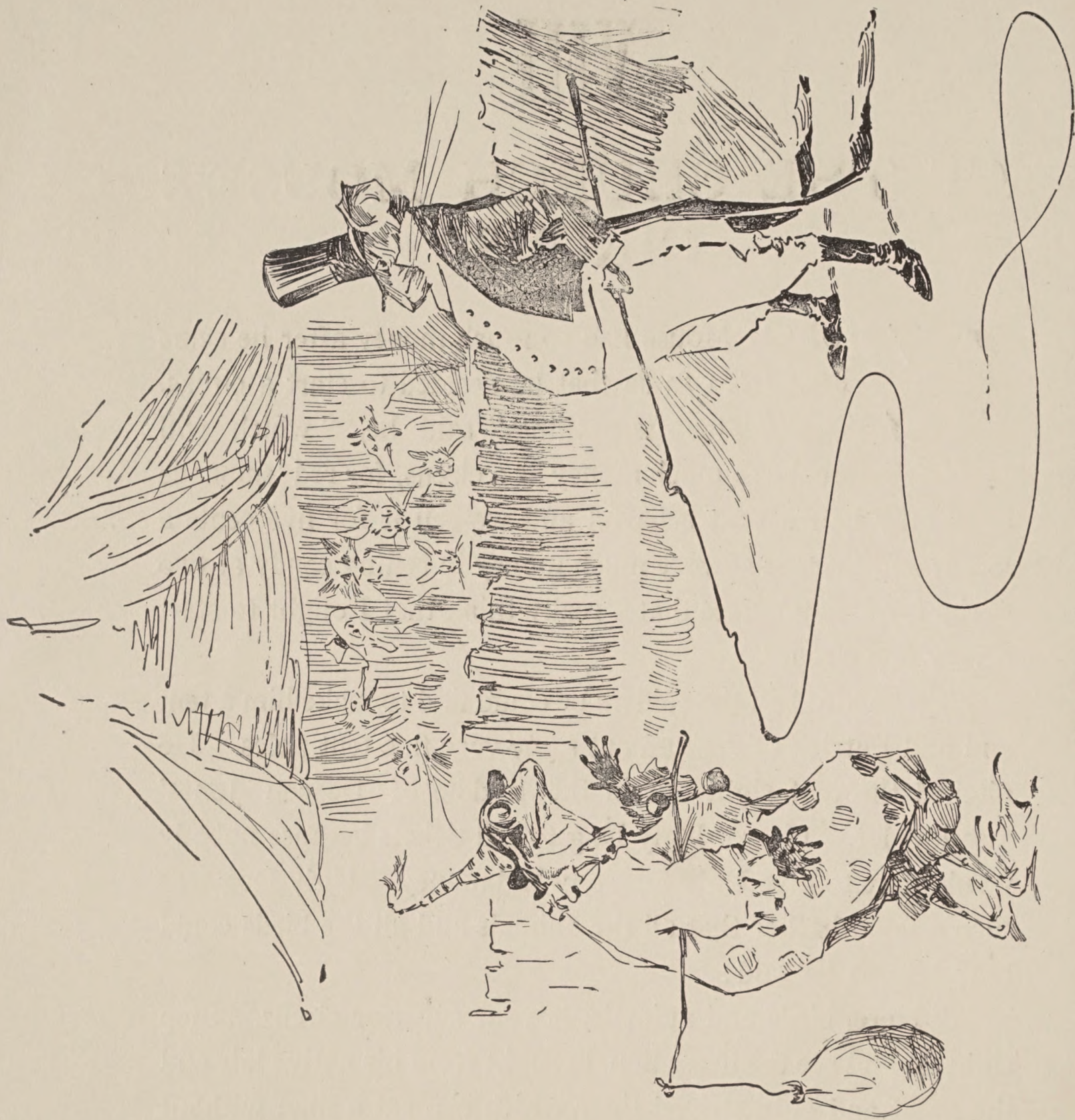
CLOWN LEAPFROG'S JOKE.